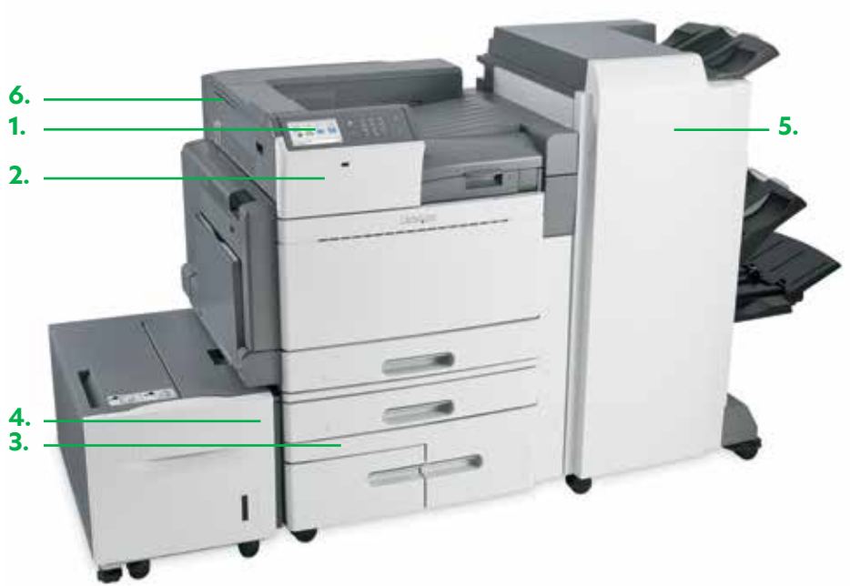
Lexmark C950de colour printer shown with optional 2,520-Sheet Tandem Tray Module, Booklet Finisher and 2,000-Sheet High Capacity Feeder.

Reduce unnecessary printing and simplify work processes through solutions applications preloaded on your device. Choose additional Lexmark solutions to fit your unique workflow needs.